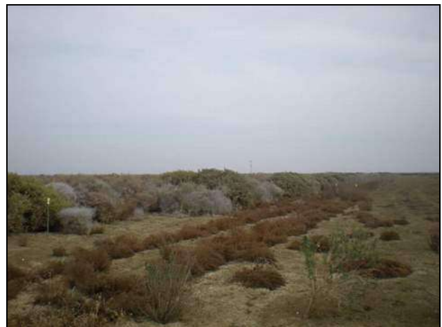
The low-growing brown vegetation in the foreground is F. salina during February, after the plants have gone dormant.