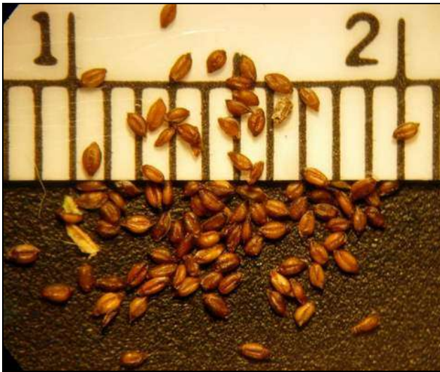
F. salina seeds. Scale shown is millimeters.