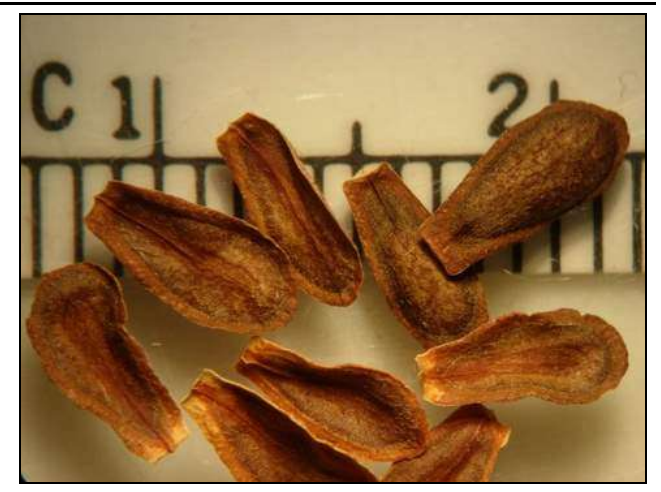
A. fascicularis seeds. Scale shown is millimeters.