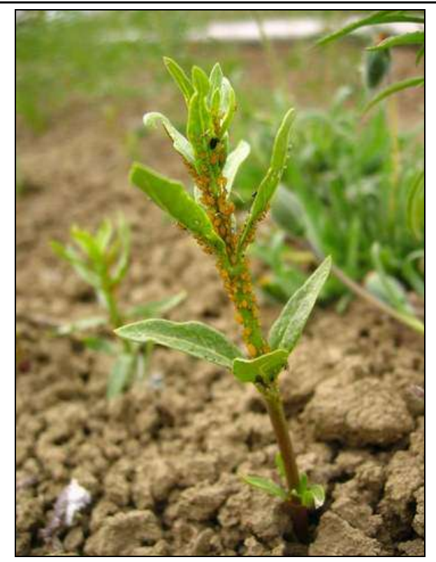
We have occasionally observed oleander aphid infestations ( Neris aphii ) on nursery-grown A. fasci cularis plants.