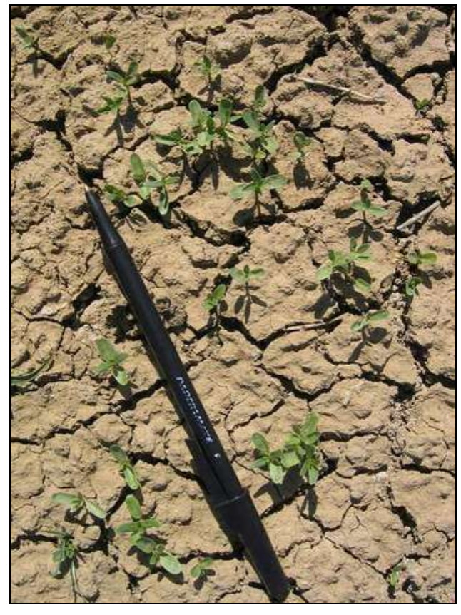
A. fascicularis seedlings at the native plant nursery during April 2007.