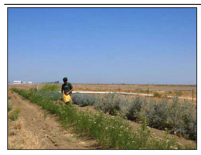
A. fascicularis in cultivation at the native plant nursery. Astragalus oxyphysus (Mt. Diablo milk-vetch) is growing on the right.