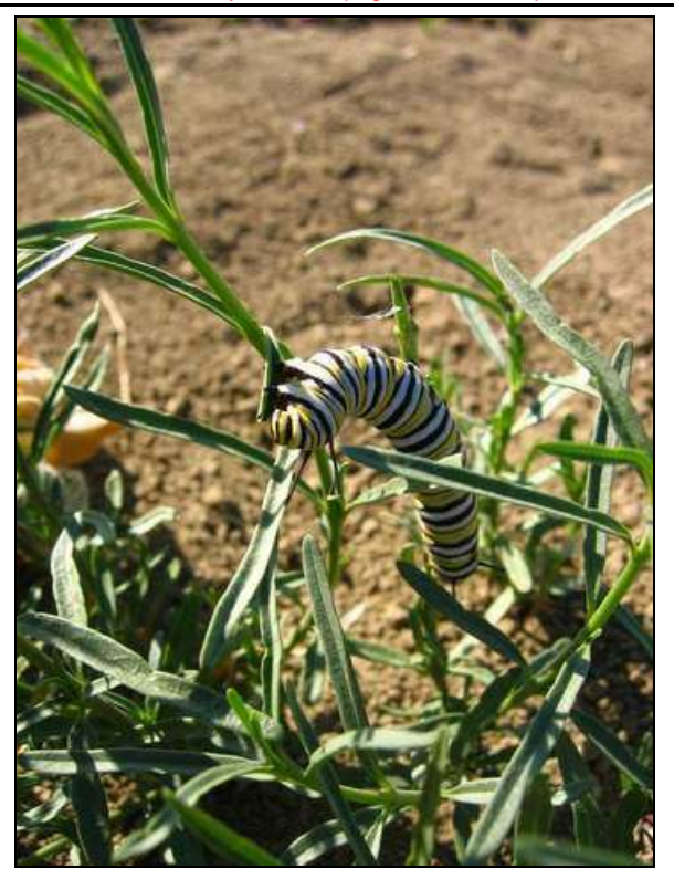
A monarch caterpillar feeding on A. fascicularis at the nursery.