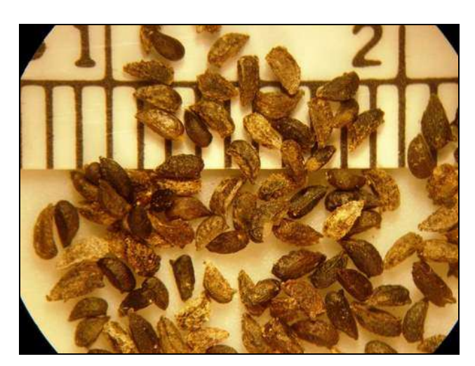
C. pungens seeds. Scale shown is millimeters.