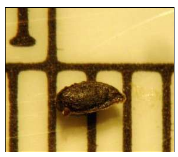
C. pungens seed. Scale shown is millimeters.