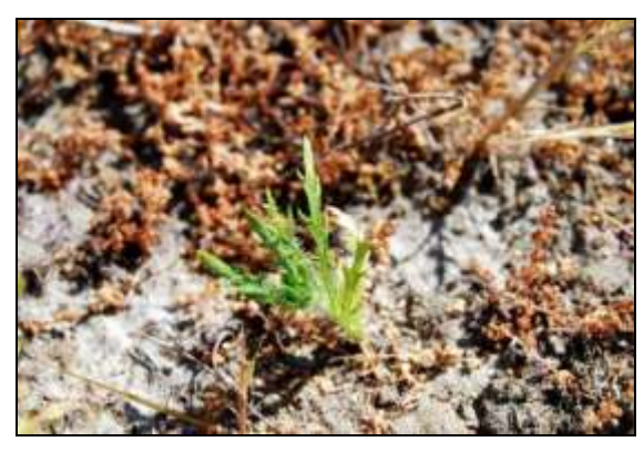
C. pungens seedling, March 2009