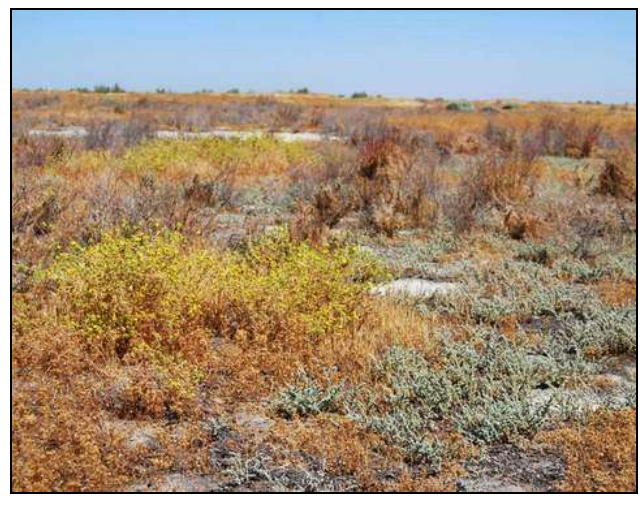
C. pungens (with yellow flowers) at the Alkali Sink Ecological Reserve (managed by the California Department of Fish and Game).